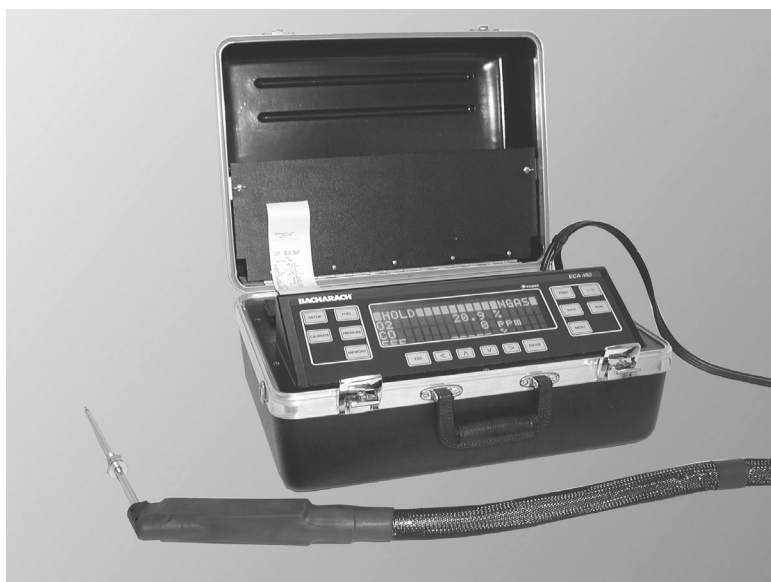
Figure 2-1. Bacharach ECA 450 Analyzer

The ECA 450 measures 18" x 14.5" x 10" and weighs 25 pounds. An on-board printer permits printing hard copy of gas parameters; up to 1,000 data points can be stored internally. An RS232 interface provides the option to send the data to a computer. An optional sample conditioning system that includes a probe with a heated sample line and a Peltier cooler/moisture removal system is available and was used in these verification tests. The conditioning system is recommended for sampling NO, NO 2 and SO 2 . A large vacuum fluorescent display screen displays the gas parameters being measured in real time.